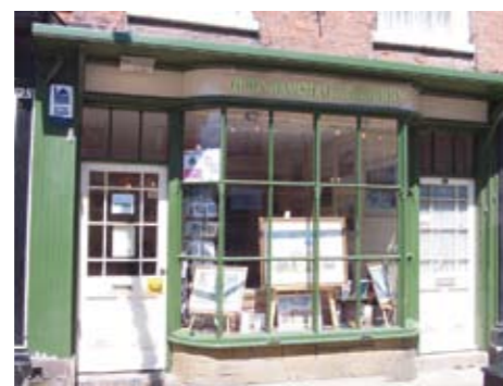
Glen Marshall Gallery, High Street Old Town