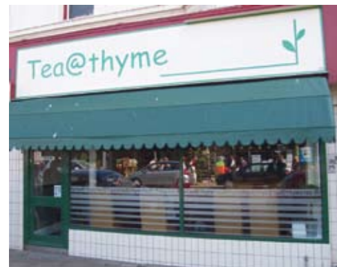
Tea@Thyme - stylish tea rooms - Prospect Street