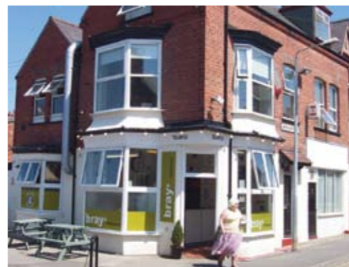
Bray's accredited Fish Shop, Lansdowne Road