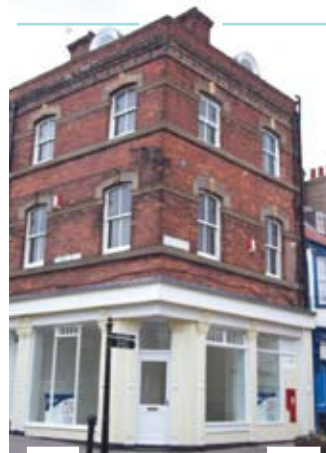
The Old Post Office, High Street (now available to let) and upper floors - restored to former glory