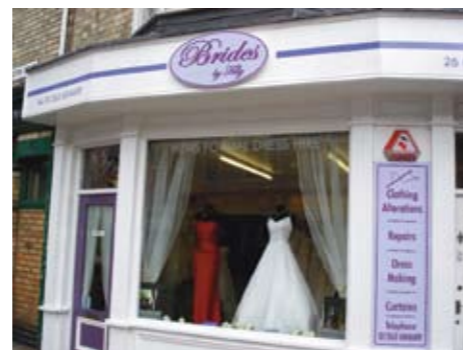
Brides by Tilly, Prospect Street