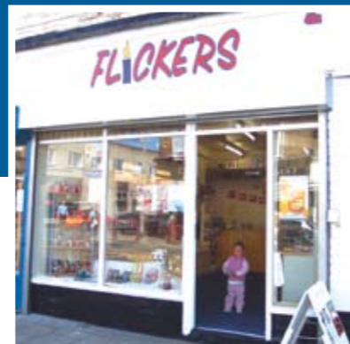
Flickers Candles - The Promenade