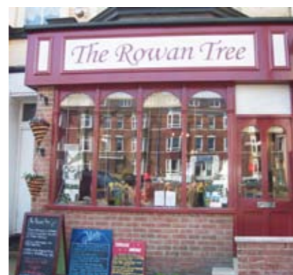
The Rowan Tree - Regents Terrace Organic, Free range & local produce café