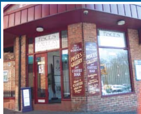
Pisces Contemporary Gallery & Coffee Shop - Prospect Arcade