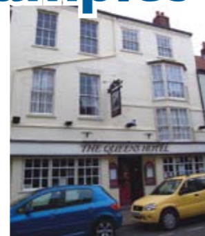
The Queen's Hotel, High Street

galleries, fine restaurants, craft shops and antique venues, along with a good range of quality day-to-day shops, traditional pubs and ample parking Old Town is leading the way in how to regenerate an area through quality investment.