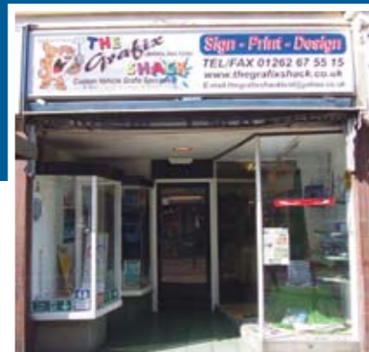
The Grafix Shack, Prospect Street - signs/print

If you have, or know of, a new or relaunched business that should be featured here (whether grant-aided or not), please let us know through contacts in centre pages.