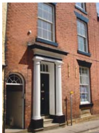
Georgian Apartments, High Street