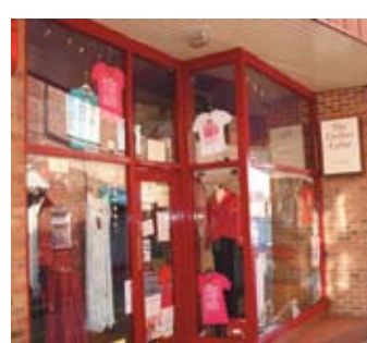
Clothes Cellar, Prosepect Arcade