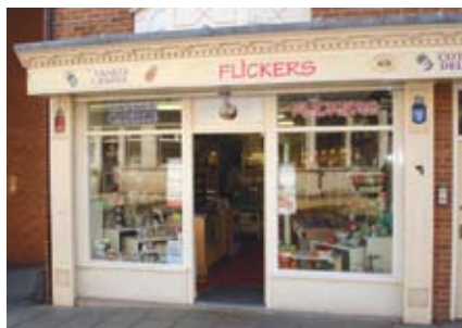
Flickers Yankee Candles, Manor St.