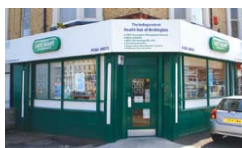
Late Night Pharmacy, Promenade