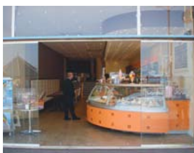
Vanilla Continental Café, Esplanade