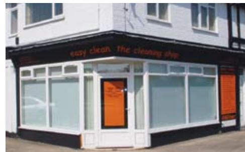
The Cleaning Shop, Queensgate