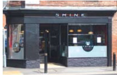
Shine Hairdressers, Quay Road