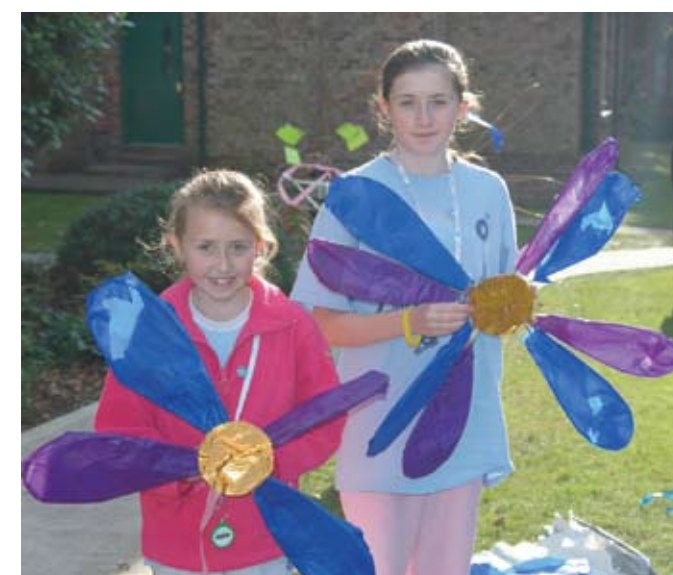
Two of the happy faces at last year's event