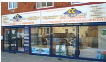
Creative Ceramics, Vernon Road

New businesses.. During 2007/8 Renaissance News has featured almost 70 new or refurbished local businesses Please note that new and refurbished businesses are also displayed on the renaissance website for six months - www.bridlingtonrenaissance.com