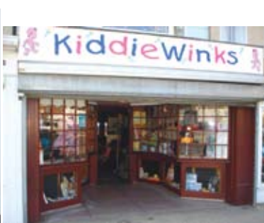
Kiddiewinks Prams, Promenade