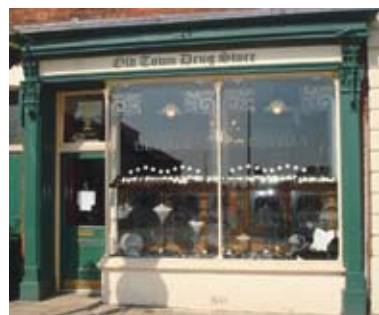
Ultima Crafts, High Street