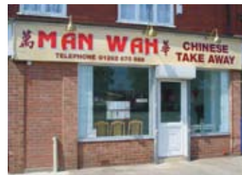
Man Wah Chinese, Queensgate