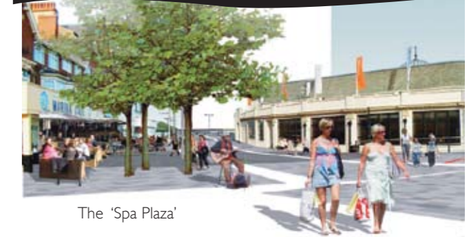
The 'Spa Plaza'

The exciting project for the re-development of public areas around The Spa is now in at a crucial stage. The grant funding application was submitted to the Department of Culture, Media and Sport (DCMS) "Sea Change" programme at the end of October, and the judging panel from CABE (Commission for Architecture in the Built Environment) visited Bridlington on 12th November to assess the project.