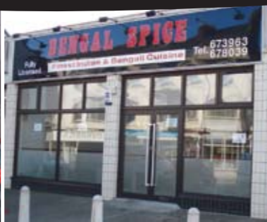
Bengal Spice, Hilderthorpe Road