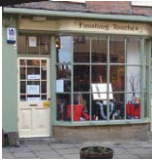
Finishing Touches, High Street