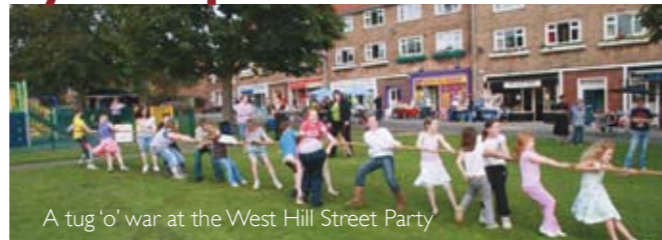
A tug 'o' war at the West Hill Street Party

West Hill Community Services Street Party held in September brought the community together for fun and games. If you are holding a community event which you would like to be included in the events listing, or would like a photo of the event in Renaissance News, please let the Renaissance Office know.