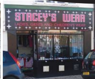
Stacey's Wear, Flamborough Road