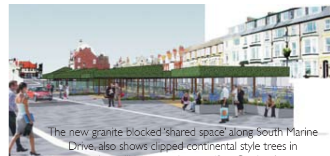
The new granite blocked 'shared space' along South Marine Drive, also shows clipped continental style trees in what will become the new 'Spa Gardens'

The exciting project for the re-development of public areas around The Spa is now in at a crucial stage. The grant funding application was submitted to the Department of Culture, Media and Sport (DCMS) "Sea Change" programme at the end of October, and the judging panel from CABE (Commission for Architecture in the Built Environment) visited Bridlington on 12th November to assess the project.