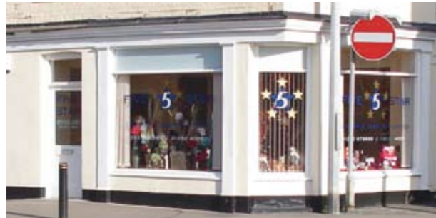
Five Star Cleaning, Quay Road/Queensgate junction