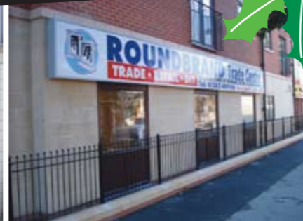
Roundbrand PVCu Centre, Hilderthorpe Road