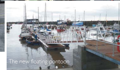
The new floating pontoon