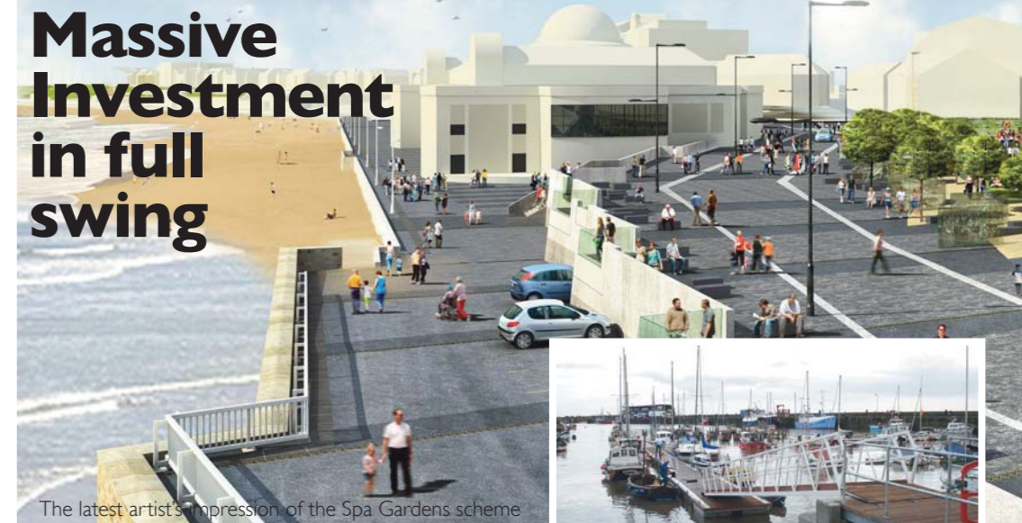
The latest artist's impression of the Spa Gardens scheme

Please note: This is an independent publication from the Renaissance Partnership